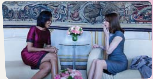
Bruni with Michelle Obama in 2009

Looking for inspiration ? Call our psychics today at 1-866-960-6498